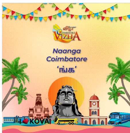
Click to View